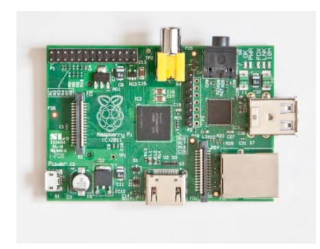
Fig.1. Raspberry pi is the simple hardware system which ensures portability of the assistive reading system

IJREAT International Journal of Research in Engineering & Advanced Technology, Volume 1, Issue 6, Dec-Jan, 2014 ISSN: 2320 - 8791 www.ijreat.org